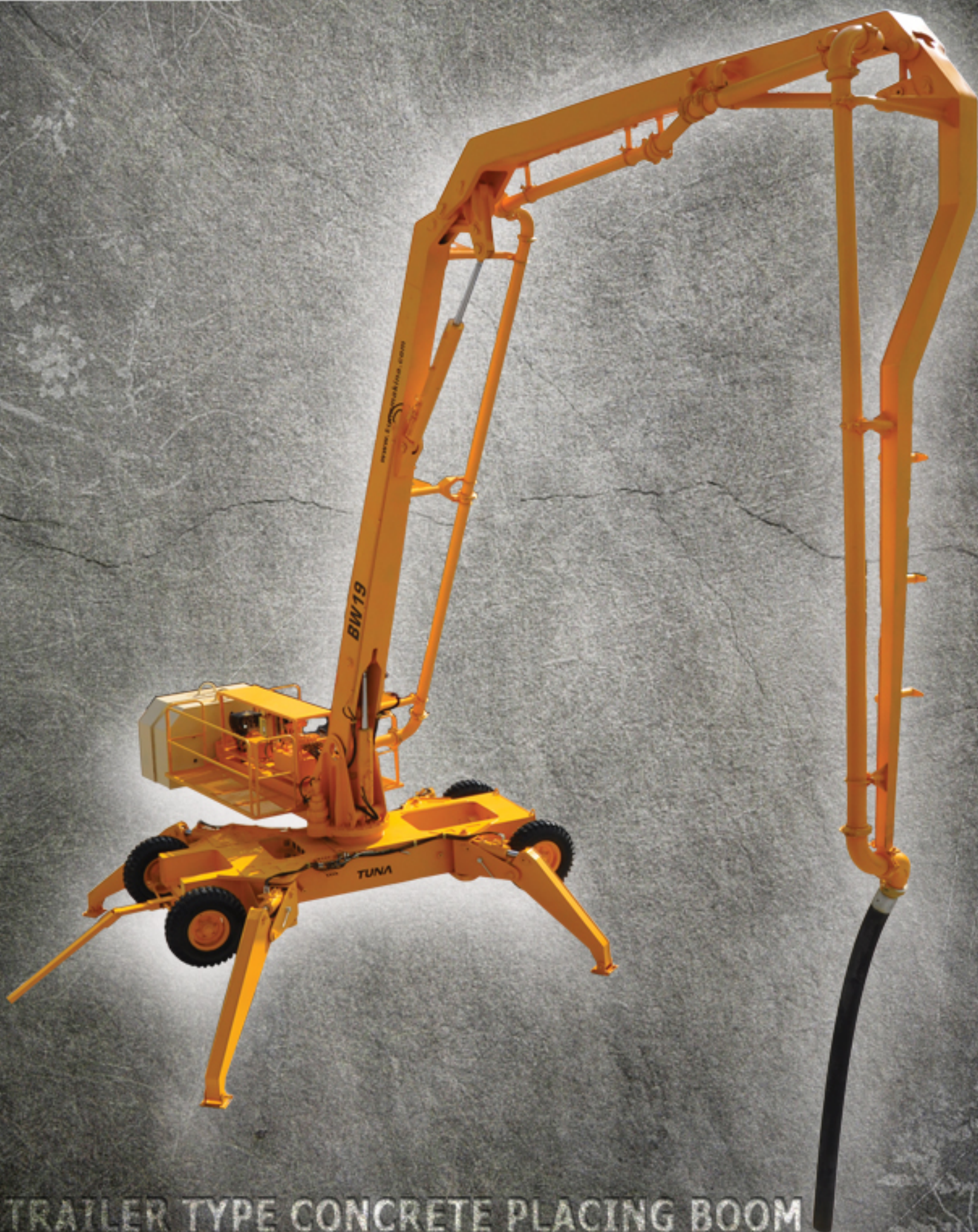
TRAILER TYPE CONCRETE PLACING BOOM